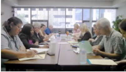
SEIU bargains with the State in 2015

The bargaining teams have been finalized and the first dates have been set as bargaining between the three State Units, HSS, Techs and S&E's begins in late July. Bargaining surveys are starting to go out requesting input for the bargaining teams to use as they craft proposals for negotiations. When you receive your survey please take the time to complete and return it so the teams know the priorities of the membership on wages, healthcare and other issues of concern in your workplace. The State will provide its economic message to all the Unions in early August.